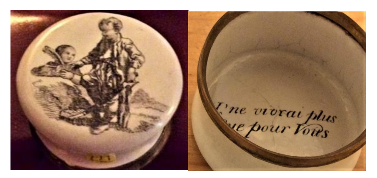
Print on base of Patch Box