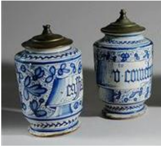
The lamps shown in the Doyle catalogue

My successful purchase inspired me to search online for other Majolica lamp bases, and I came across many true horrors from Victorian times. But then I was drawn to an estate sale at Doyles auction galleries in New York in the spring of 2007. On offer was furnishings from the estate of a Washington socialite. In the catalogue photograph, a pair of lamps looked remarkably familiar, and happily my absentee bid was successful. While waiting an eternity for the shipping process, I enquired after the provenance of the lot of table lamps I had bought.