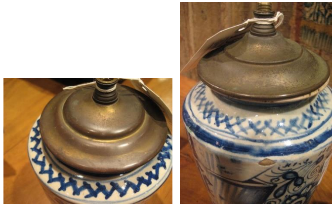
Extra photographs sent to me from Doyle