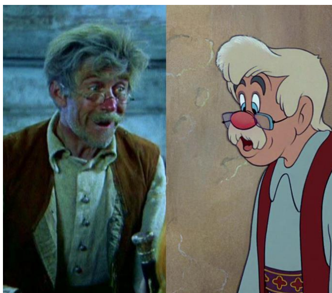
Christian Rub in The Spectacle Maker (1934) and as Disney's Geppetto

The listing gave an interesting provenance. The seller had bought the lamp many years earlier from the estate of a Hollywood character actor who appeared in more than 100 films, though I must admit that at the time I couldn't put a face to his name.