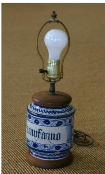
The lamp from Hawaii

Fifteen years ago I was still new to eBay and searched in all the wrong places, and this is why I came across by accident a lamp base that was put up for sale by a seller in Hawaii. I knew at once that it was early, and at $150 US dollars it was reasonably priced. I took the chance that it would arrive safely in the post and that I would be able to remove the unsightly lamp fittings, so I clicked the buy button.