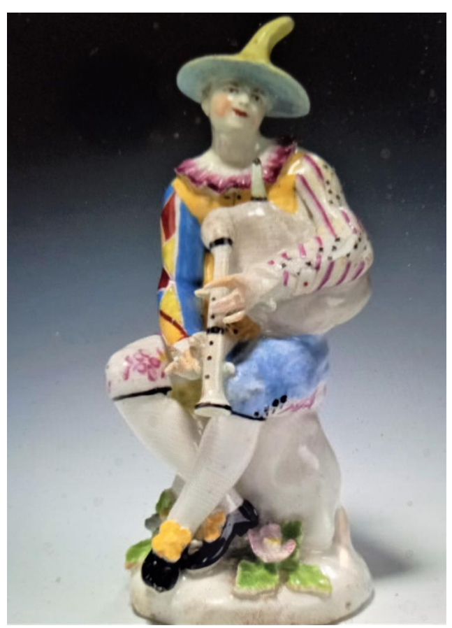
A Bow Harlequin figure