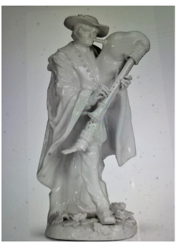
A Meissen figure