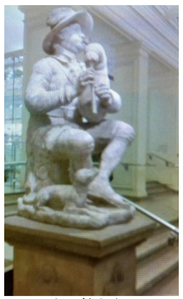
Statue of the Bagpiper

This paper is suggesting a possible inspiration for the figure of the Bagpiper, made by several early manufacturers.