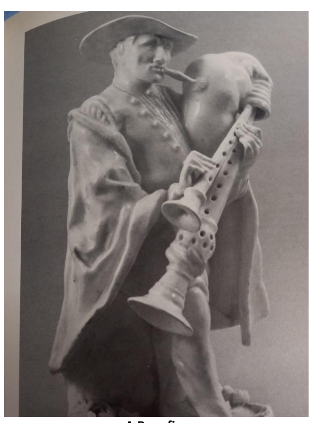
A Bow figure