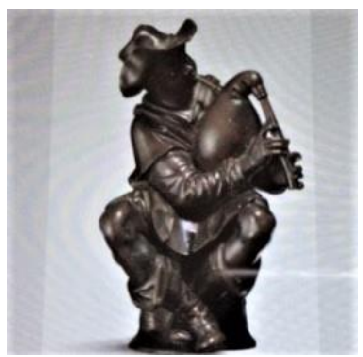
The Bagpiper in Bronze

I'd like to suggest another figure that could join the source possibilities.