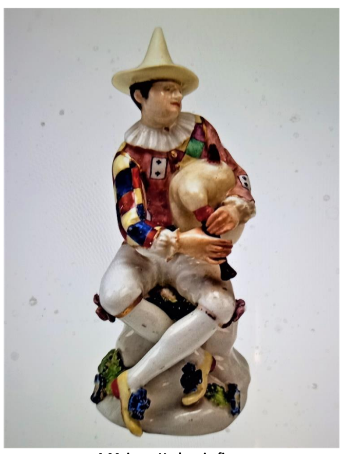
A Meissen Harlequin figure